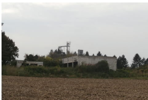
Lovas: The silo used by Serbian forces and the mine field in which civilians were killed

Evidentiary hearings resumed on July 19 th and September 23 rd . The court inspected the documents in the case file at these hearings.