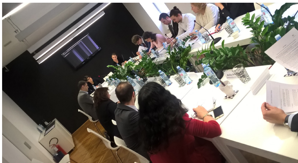
Meeting on inclusion of transitional justice issues in Serbia's EU accession process

In mid-April 2016 the HLC delivered to the European Commission the Annexe to the 2016 Serbia Report . The HLC pointed to the insufficient cooperation with the ICTY and the shortcomings in the prosecution of war crimes before the courts in Serbia, the problems that victims face in their attempt to realize their right to reparation, the stagnation in the search for the missing and the complete absence of