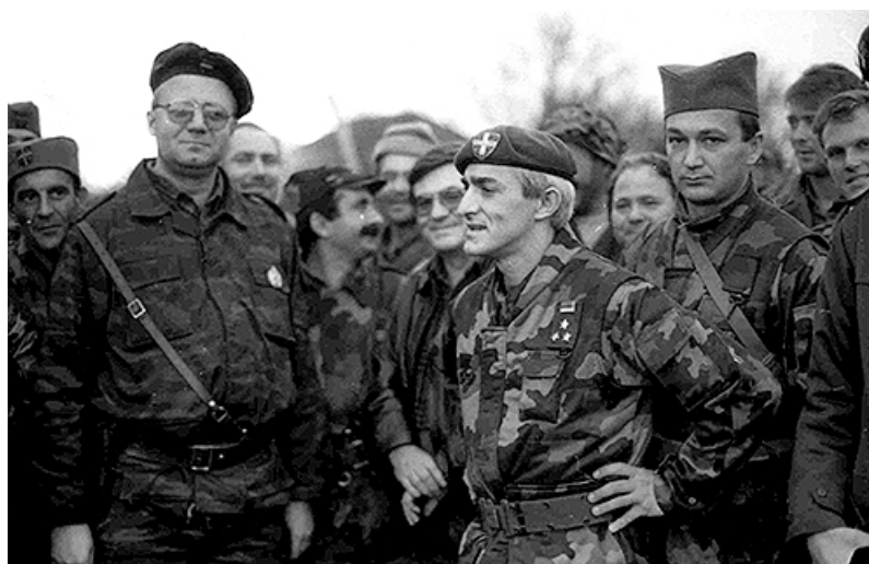
Vojislav Šešelj in Benkovac (Croatia) in 1991

The EP adopted a Resolution on Serbia: The Case of Accused War Criminal Vojislav Šešelj on November 27 th . Stating that the war-mongering rhetoric of Vojislav Šešelj causes pain for victims of war