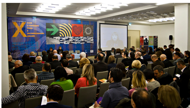
X International Forum for Transitional Justice

Non-governmental organizations, representa-