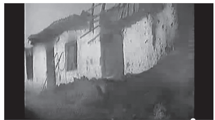
Photo 3: A burned house in Ošljane/Oshlan, CNN "Kosovo: Oshlan Massaker"