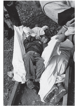
Photo 5: Children victims of war crime in Gornje Obrinje/Obri e Epërme.