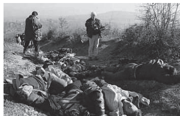
Photo 4: Bodies of victims of a mass execution in Gornje Obrinje/Obri e Epërme.