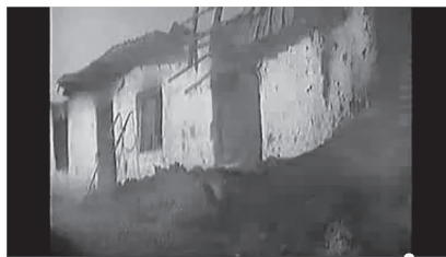
Photo 3: A burned house in Ošljane/Oshlan, CNN "Kosovo: Oshlan Massaker"