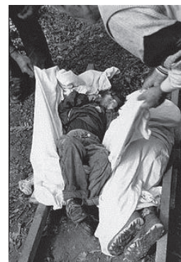
Photo 5: Children victims of war crime in Gornje Obrinje/Obri e Epërme.