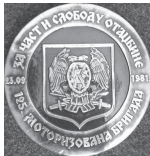
Photo 1: Insignia of the 125 th MtBr.